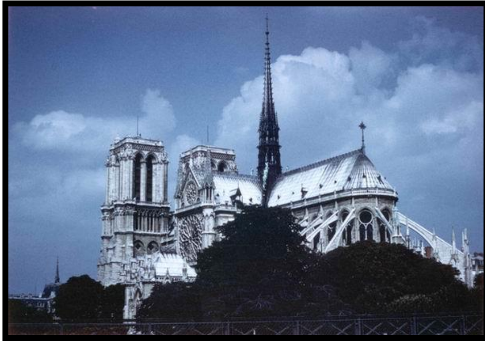
Notre Dame Cathedral, Paris, France