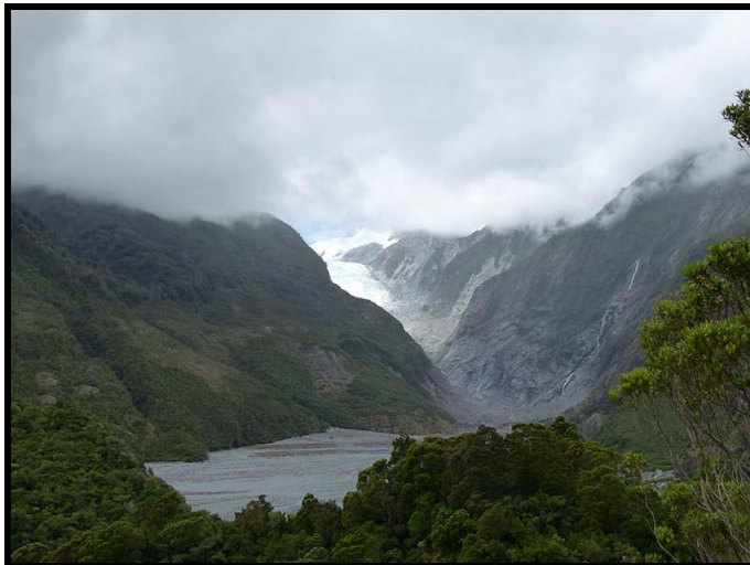
Jamison Valley, Blue Mountains National Park, Australia Franz Josef Glacier, Westland Tai Poutini National Park, New Zealand