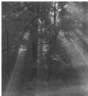
Blei and Odian, GOB Fig. 7.13

The casein is soluble, so colloids do not settle out