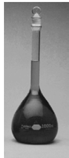
3. Dilute to final volume