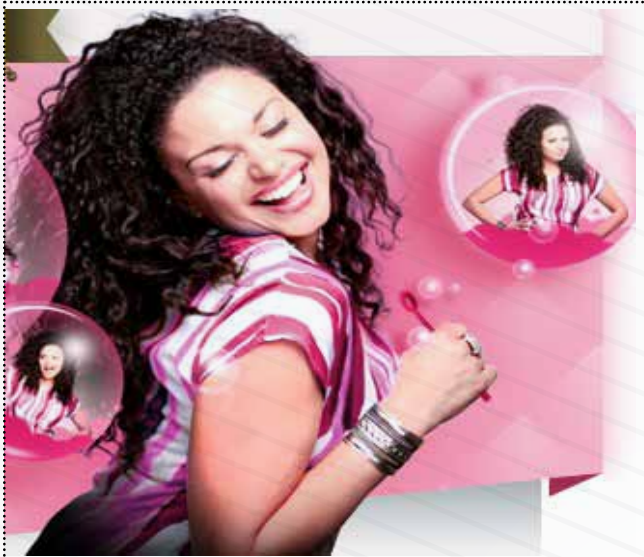
UAB Presents: Comedian Michelle Buteau Wednesday, March 30, 2011 7:30 pm Cody Commons