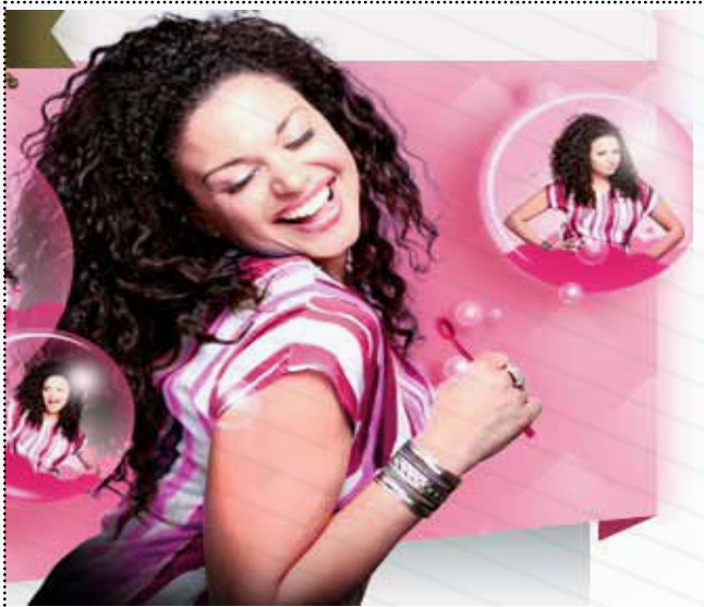
UAB Presents: Comedian Michelle Buteau Wednesday, March 30, 2011 7:30 pm Cody Commons