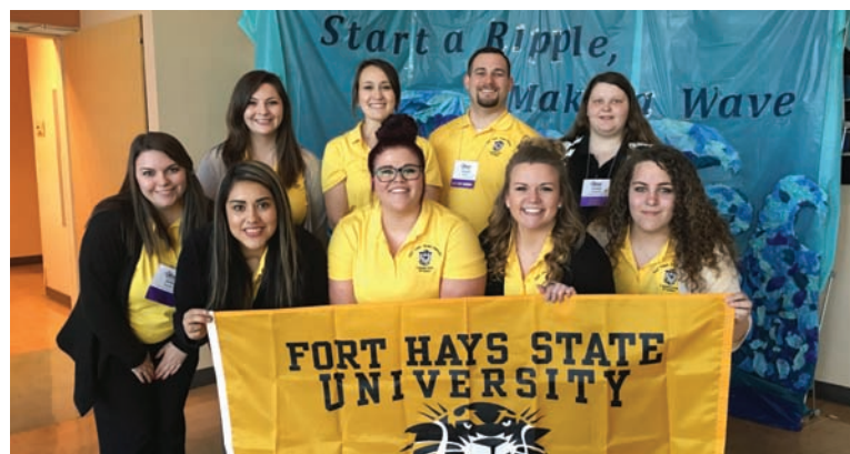
Pictured are the 2015-2016 VALUE Scholars.