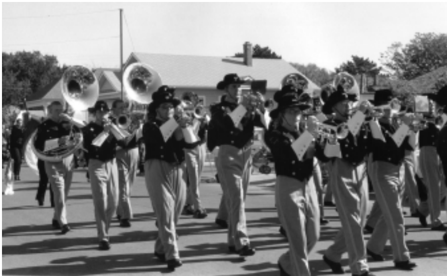
The 2001 Tiger Marching Band marches down Main Street in Hays in new Centennial uniforms as part of Homecoming 2001 celebration activities.