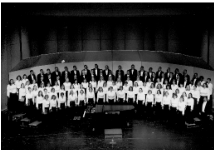
The FHSU Concert Choir