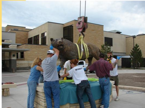
Memorial Union undergoing renovation

Phone: 785-628-5305 Fax: 785-628-4007 www.fhsu.edu/union