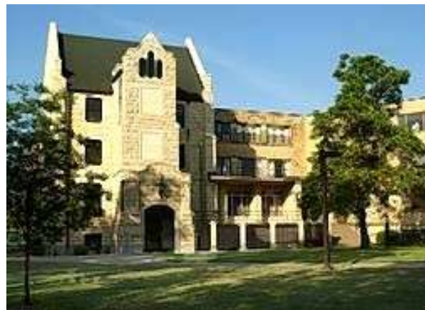
Custer Hall, home of the Kansas Academy of Mathematics & Science