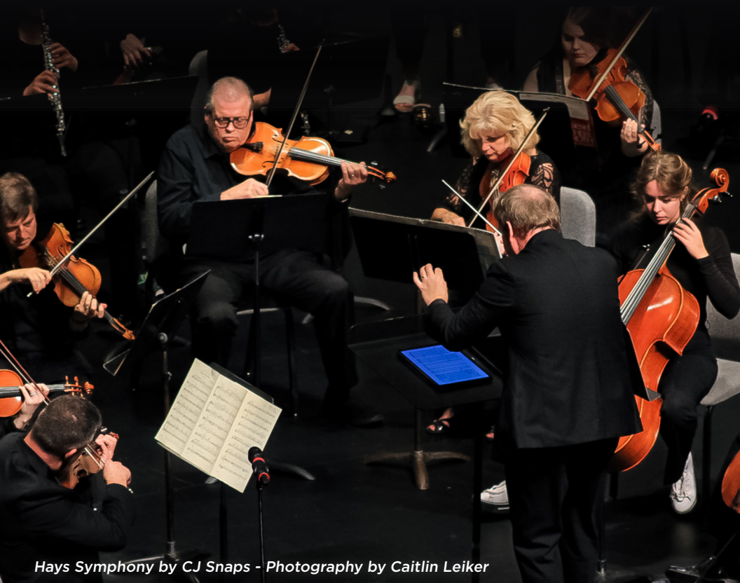
Hays Symphony by CJ Snaps

Your destination for arts and entertainment