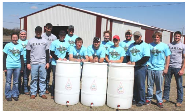
Students in the Home Horticulture Class built rain barrels for the community in Spring 2013.

landscape. This service-learning project allows students to integrate community service activities into the academic curricula.