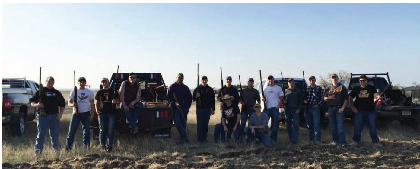
Members of the AGR Fraternity enjoying their annual trap shoot.

All other members who do not compete in the cook-off compete in games that the barbecue provides.