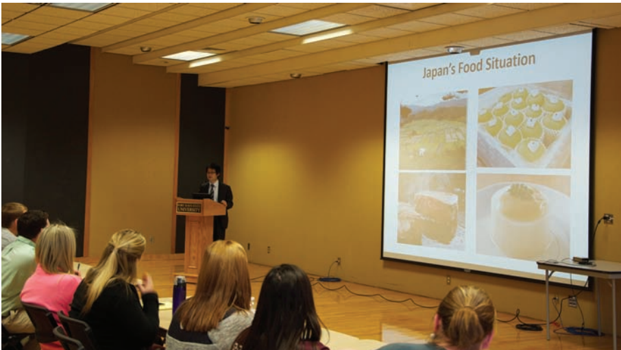
Consulate General of Japan, Ko Hikasa kicked off the International Agriculture Conference on April 20.

The inaugural International Agriculture class held a one-day conference featuring consulates from foreign countries speaking at FHSU on April 20 during Ag Awareness week.