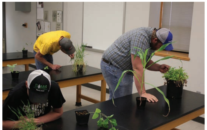
Pictured right is the Crops Judging Team practicing for an upcoming contest.

Crop judges earn a scholarship and knowledge that will be applied to their respective post-curricular careers. As long as they remain in the agricultural field they will be able to use what they have learned in one way or another. They also gain valuable experience in a competitive atmosphere.