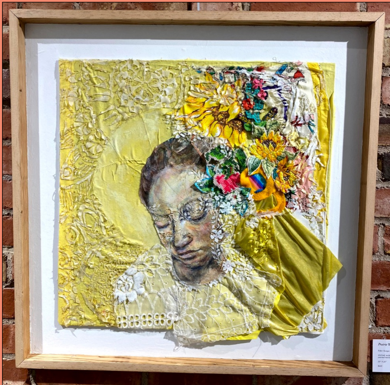
Prairie Woman Eden Quispe stitched, soldered and painted textiles 20" X 20" 2017 BACD