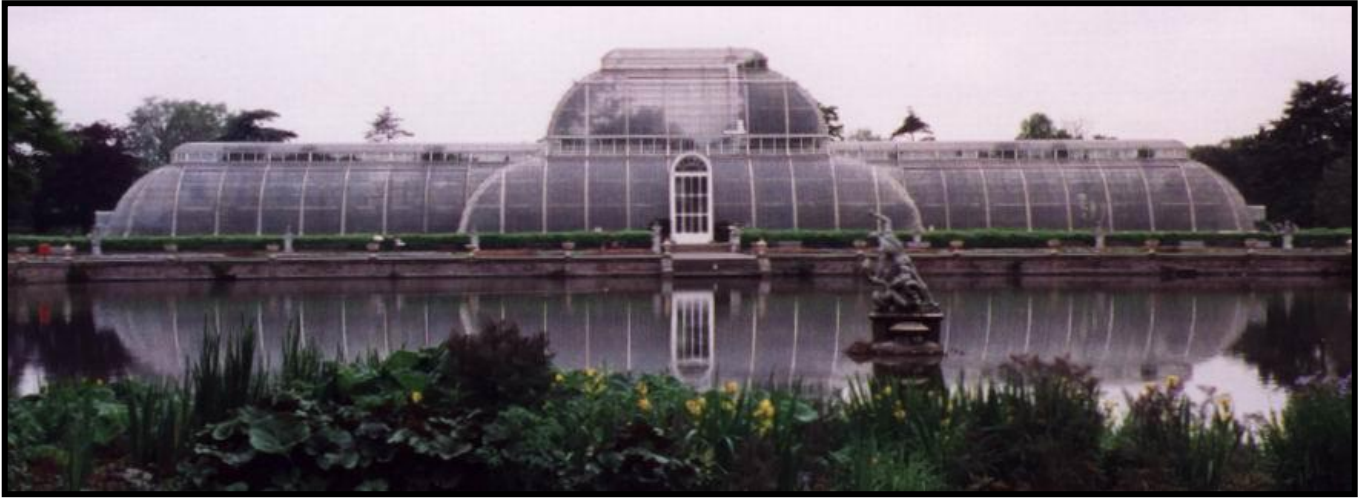
Palm House, Royal Botanic Gardens, Kew, England

(England 1991, 1995, 2011; England and Wales 1997, 1998)