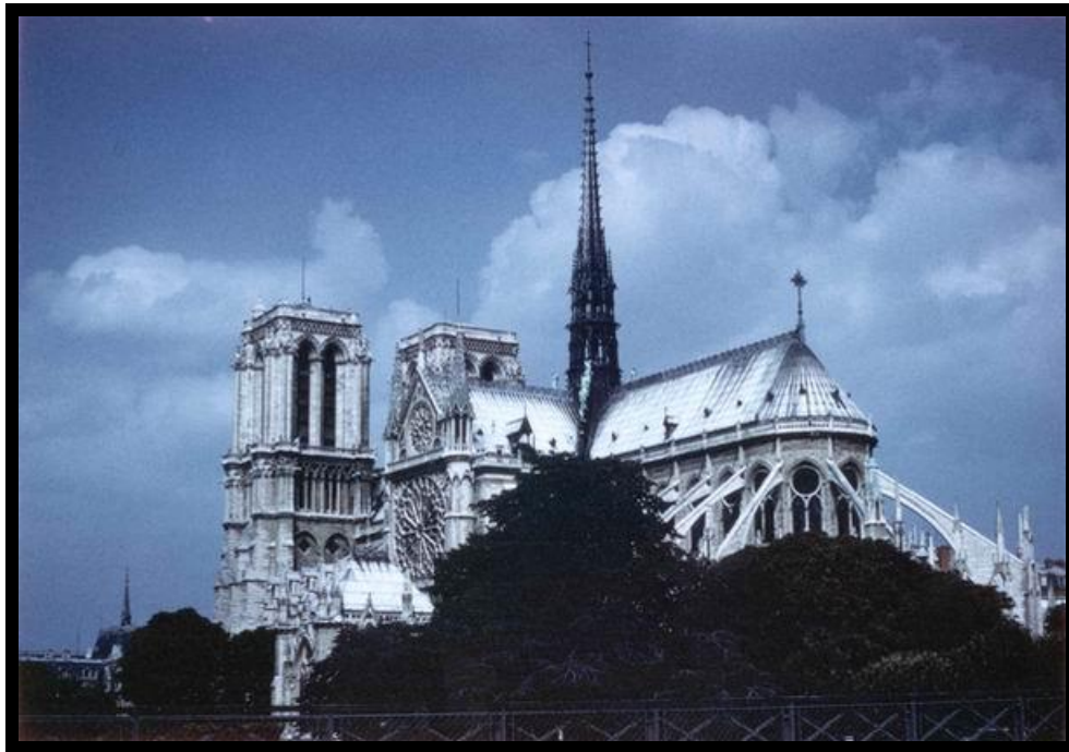
Notre Dame Cathedral, Paris, France