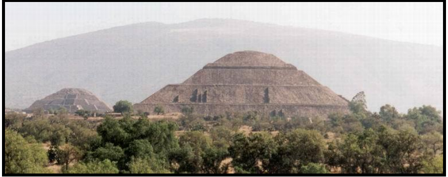
Lake Louise, Banff National Park, Alberta, Canada Pyramids of the Moon and Sun, Teotihuacán, Mexico