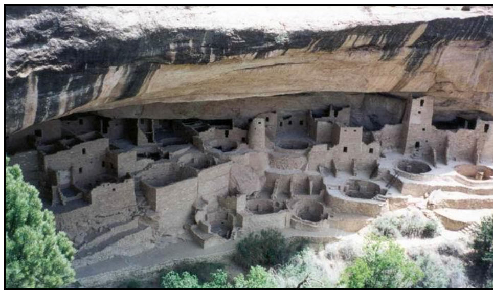
Cliff Palace, Mesa Verde NP, Colorado

Link to pdf List of Sites Visited in the USA Organized by Type of Site