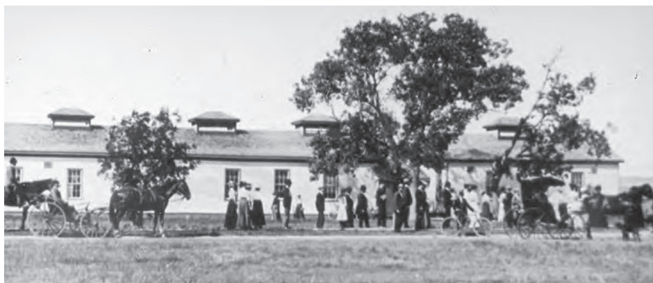
Opening Day of the Western Branch of Kansas State Normal School on the grounds of the old Fort Hays Military Reservation.