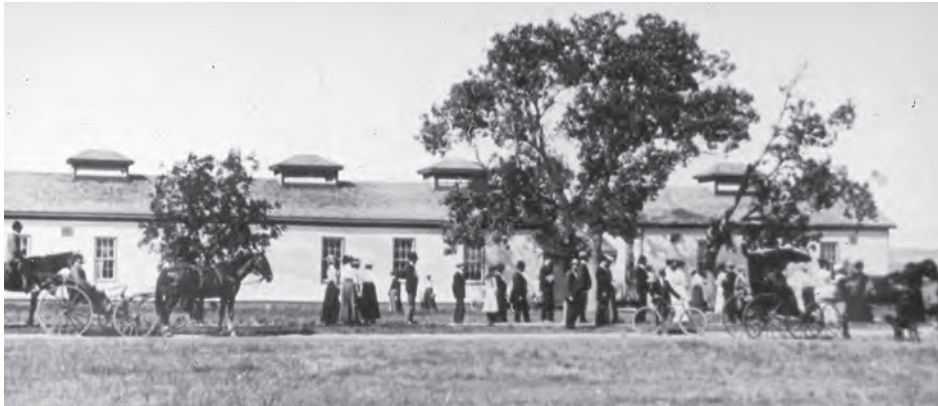
Opening Day of the Western Branch of Kansas State Normal School on the grounds of the old Fort Hays Military Reservation.