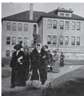
Right: South side of Industrial Building with greenhouse.