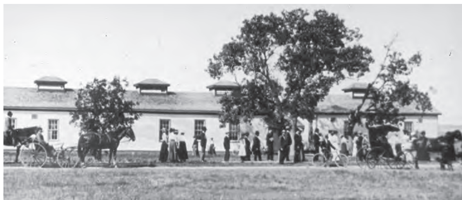
Opening Day of the Western Branch of Kansas State Normal School on the grounds of the old Fort Hays Military Reservation.