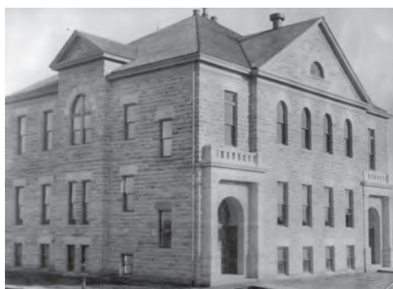
Left: Picken Hall, the first academic building on campus.