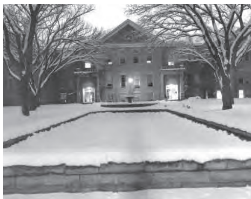
Right: Snow covers the fountain in front of Picken Hall.