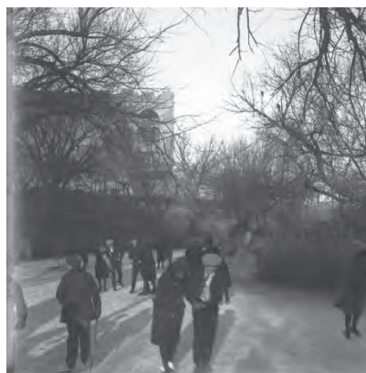
Left: People skate on Big Creek with Sheridan Hall in the background.