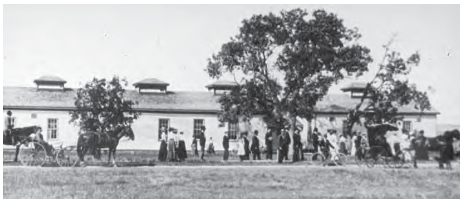
Opening Day of the Western Branch of Kansas State Normal School on the grounds of the old Fort Hays Military Reservation.