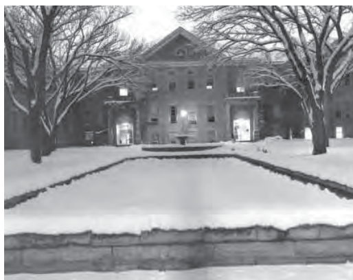
Right: Snow covers the fountain in front of Picken Hall.