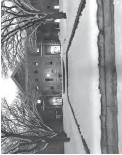
Left: People skate on Big Creek with Sheridan Hall in the background.