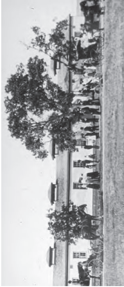
Opening Day of the Western Branch of Kansas State Normal School on the grounds of the old Fort Hays Military Reservation.