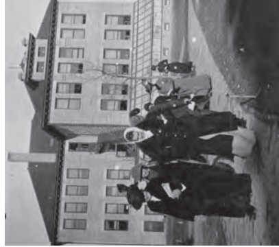
Left: Picken Hall, the first academic building on campus.