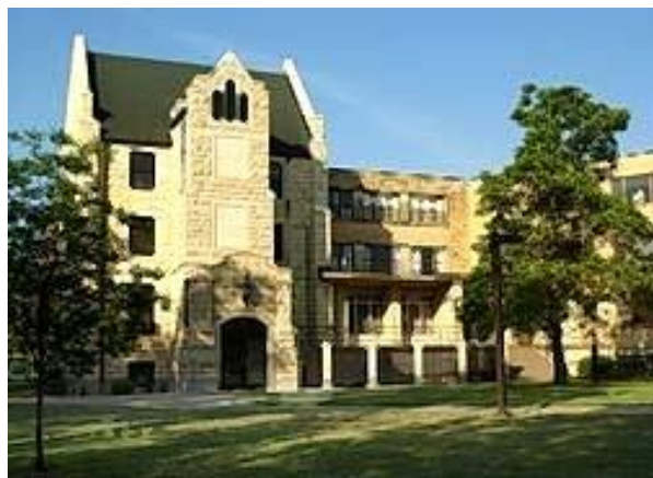
Custer Hall, home of the Academy of Mathematics & Science