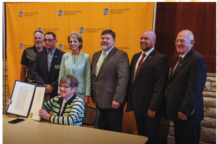
Governor Laura Kelly ceremonially signs HB 2290, the historic Affiliation legislation, at Fort Hays State University on June 14, 2023.