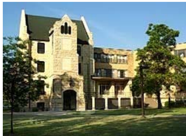
Custer Hall, home of the Kansas Academy of Mathematics & Science