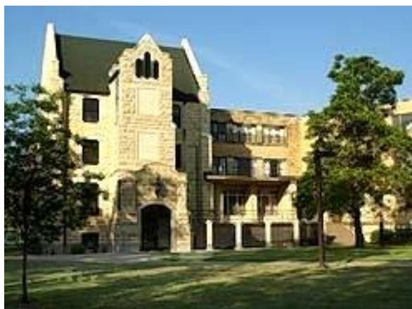
Custer Hall, home of the Kansas Academy of Mathematics & Science