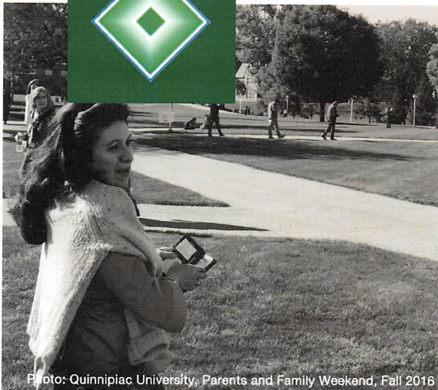
Photo: Quinnipiac University, Parents and Family Weekend, Fall 2016