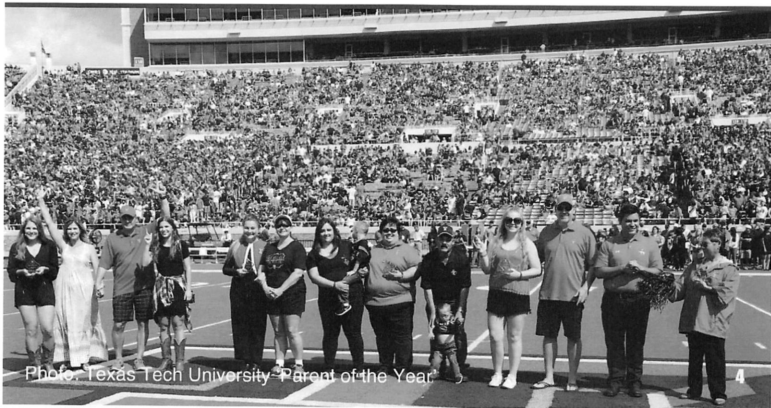
Photo: Texas Tech University Parent of the Year

Parent and family programs are a critical component of transition initiatives at Fort Hays State University, especially for the families of incoming students. The Parent and Family Orientation team at FHSU strives to make the transition as seamless as possible for families sending students to the FHSU community.